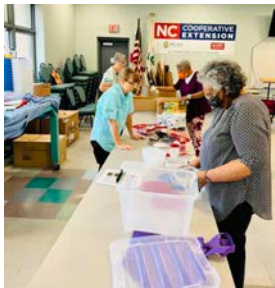
Rutherford County ECA volunteers working as a team to complete the Kitchen Project Kits for distribution.