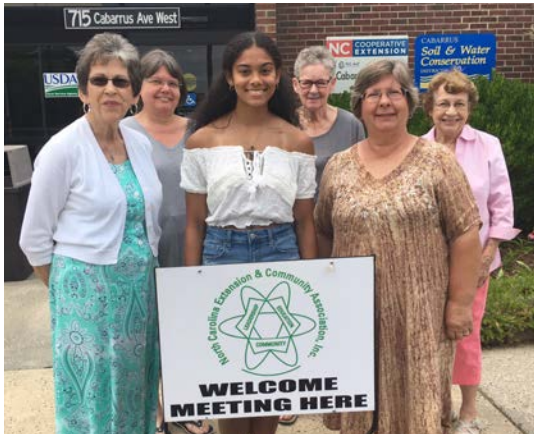
The Cabarrus County ECA officers with their scholarship winner!