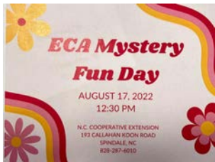
Rutherford County ECA members are excited about the upcoming Mystery Fun Day August 17,2022