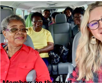
Members on the way!

The Stanford-Duplin ECA has participated in several volunteer efforts this fall. The first event was the 2019 Muscadine Festival in September, where members assisted with tickets and other areas of the festival. In October the club prepared an educational booth for our agribusiness county fair. The booth theme was “Helping Hands Outreach” and showcased community projects the club has completed. The members have also gathered canned goods to contribute to First Missionary Church of Warsaw and Sarah’s Refuge Domestic Violence and Rape Crisis Center.