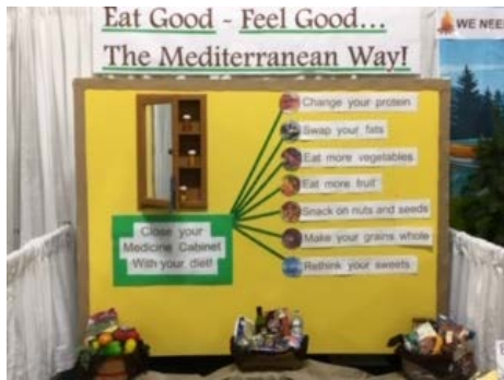
1st Place Cold Water ECA Club with the topic of "Eat Good-Feel Good the Mediterranean Way"

Cabarrus County ECA members completed beautiful and very educational fair booths for the recent 9 day Cabarrus County Fair . Top Honors were awarded o these exhibits: