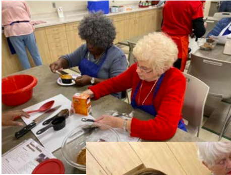
Wayne County ECA members enjoying the 2019 Christmas Party!