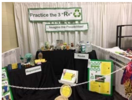
3rd Place Culinary Adventurers ECA Special Interest Club "Practice the 3 R's...Imagine the Possibilities"