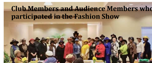
Club Members and Audience Members who participated in the Fashion Show

They also displayed their cultural arts items they made all year. The audience was invited to participate in the fashion show and strut their stuff. The members had a blast and loved having the audience get involved as well. They raised over $1400 at the event, and plan to host this as an annual fundraiser!