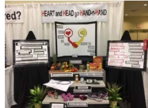
2nd Place Rimer ECA Club with the theme of "Heart and Head go Hand n Hand".