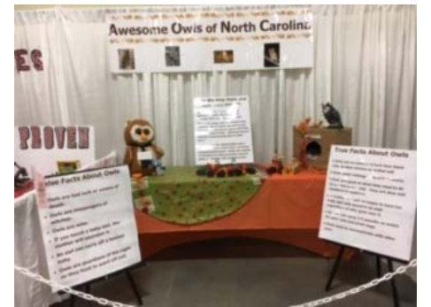
4th Place Artistic Adventurers ECA Club "Awesome Owls of North Carolina".

Also earning Honorable Mention Awards were the Bethel Midland ECA Club, Cabarrus County ECA Council, and the Country Neighbors ECA Club.