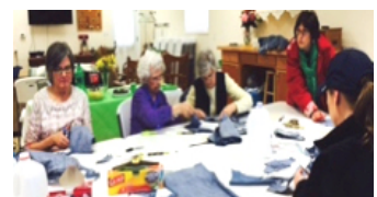
Ambassador ECA Club Sole Hope Party

Sole Hope is a project "offering HOPE, healthier lives, and freedom from foot-related diseases through education, jobs, and medical relief." Sole Hope helps create jobs to shoemakers and tailors, while providing shoes for children to help protect from jigger infestations. All you need to get started is a Shoe Cutting Party Kit, old jeans, scissors and plastic jug. Hosting a Sole Hope Party is a way to give back and affect lives thousands of miles away. Visit: www.solehope.org to learn more.