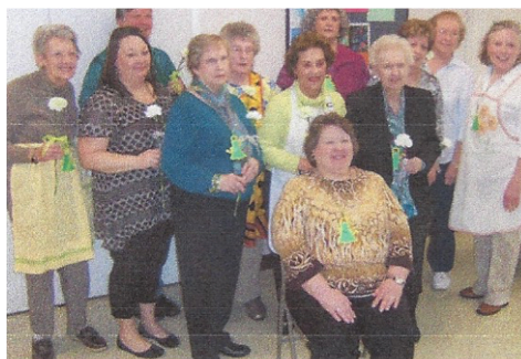
ECA Club Leaders and Members of the Year