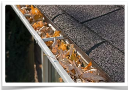
Inspect and clean gutters regularly.